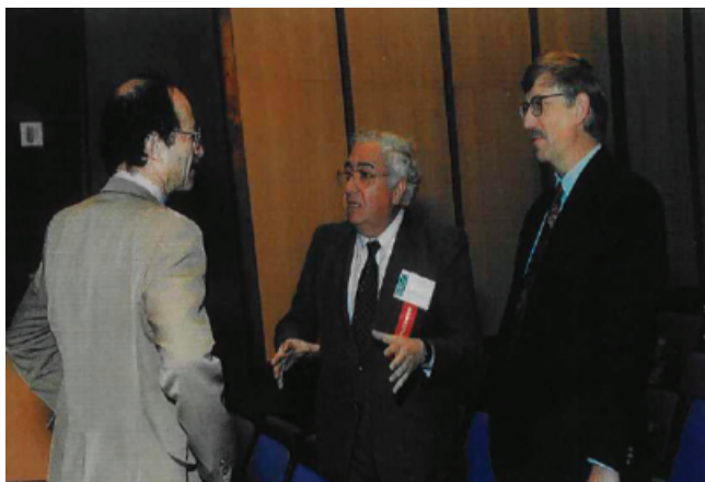
Fig. 2. Taking the search for alcoholism risk genes to the top of NIH.