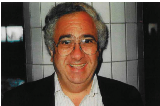
Fig. 3. I like that joke.