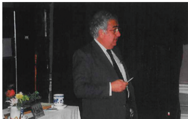
Fig. 4. If you think the question is stupid, don't ask it.