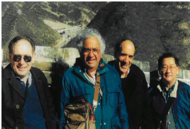
Fig. 1. Taking the search for alcoholism risk genes to the top of the Great Wall in China.

him, as he showed them magic tricks, sitting with them on the living room floor. All of them will miss Henri even more so than we can imagine.