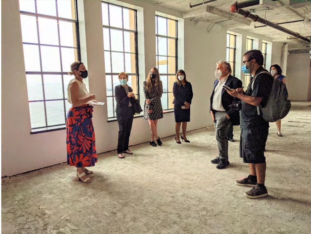
NYCEDC and BioBAT officials tour space that will receive $50 million LifeSci NYC investment

BioBAT, Inc. is a partnership created by the Research Foundation for SUNY, on behalf of Downstate Health Sciences University and NYCEDC. BioBAT works to support the advancement of the life science industry in New York City by providing facilities and resources for scientific research and advanced manufacturing at the Brooklyn Army Terminal. A focus of BioBAT's mission is to attract and retain promising research firms and develop a skilled 21st Century workforce.