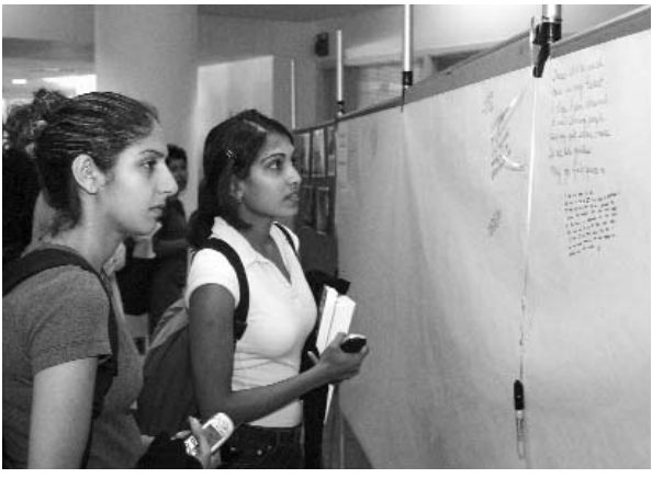
Some campus members found it easier to share their feelings in writing.

Here are scenes showing some of the ways that faculty, students, and staff chose to express their sentiments and memories of 9/11.