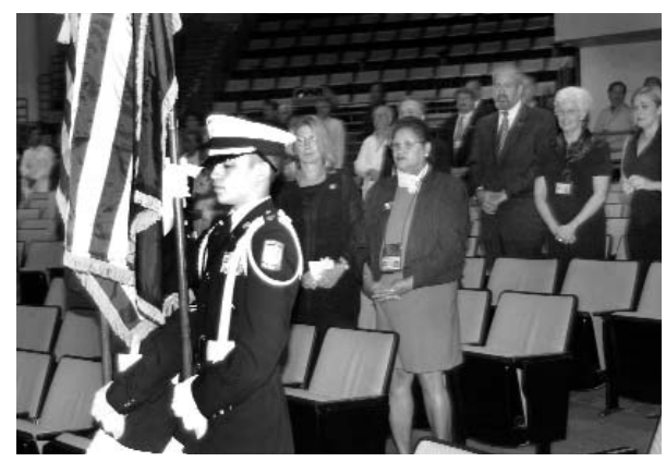
Students from Xavier High School serve as honor guard during the remembrance ceremony in Alumni Auditorium.