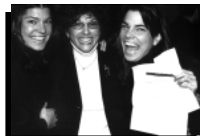
Match Day: Smiles and hugs abound.