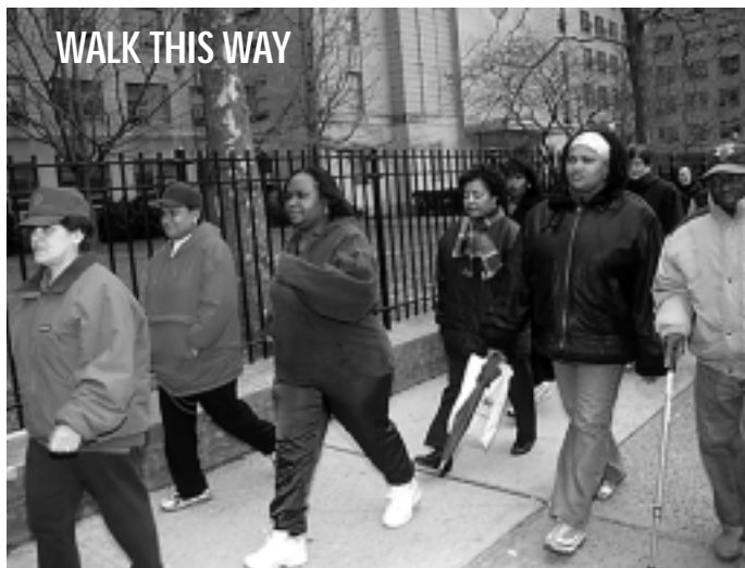
April marked the start of the Healthy Downstate Walking to Fitness program. Now three times a week (weather permitting) you can spot groups of fast walkers and slower ones on various routes throughout the neighborhood. Walkers set out from the 450 Clarkson Avenue lobby at 12:05 and 1:05 on Monday, Wednesday, and Friday, and usually return within 45 minutes. But you can walk at your own pace, too, for as long or short as you like. It's free and it's healthy, so why not join today?