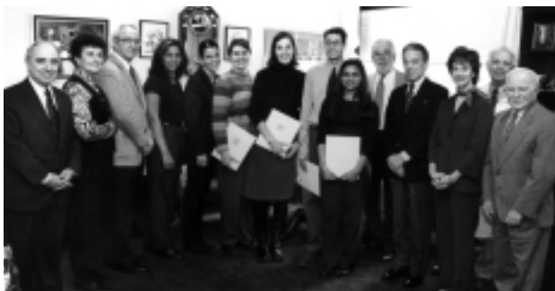
Alumni Association members, faculty, and administrators congratulate this year's study-abroad fellowship winners.

Fifteen fourth-year medical students were awarded Joshua H. Weiner, M.D., International Health Fellowships by the Alumni Fund. The fellowships will help defray expenses for students traveling to Kenya, Cuba, the Dominican Republic, India, and Thailand to participate in the Department of Preventive Medicine and Community Health's elective course, "Health Care in Developing Countries."