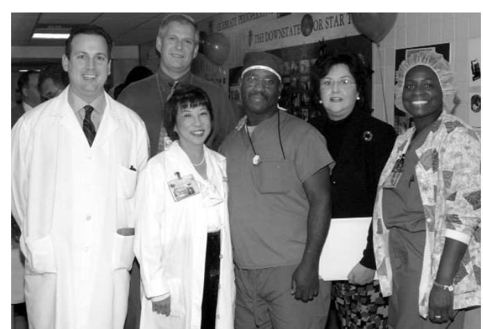
Hospital administrators join Perioperative Services in celebrating Perioperative Nurse Week in November. The staff held an open house to familiarize campus members with the OR's special equipment, facilities, and services.