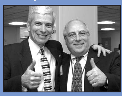
MAY - Celebrating Nurses Week

JANUARY UHB Wins High Marks in JCAHO Survey