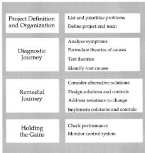
Fig 1. Quality improvement project model. Such models provide high-level, problem-solving guidance to improvement teams. This model is based on the work of Joseph Juran, as described in Plsek PE, Onnias A, Early J. Quality Improvement Tools . Wilton, CT: Juran Institute; 1989.

Having formed specific questions, the improvement team typically gathers data using simple check sheets, data sheets, interviews, and surveys. A check sheet is a form for gathering data that enables one to analyze the data directly from the form. For example, a team working to improve the timeliness of the administration of thrombolytic therapy to chest pain patients in the emergency department might construct a check sheet to study the distribution of times from presentation in the emergency room to administration of the thrombolytic. The check sheet might consist of a sheet of graph paper with a horizontal axis labeled in 10-minute intervals from 0 to 180 minutes. Each time thrombolytic therapy is administered, a responsible nurse places an X in the appropriate 10-minute interval column to indicate the elapsed time since the patient presented. After some time, a histogram of administration times emerges. The mean, spread, and characteristic shape of the time distribution can be read directly from the data collection form. In contrast, a data sheet is a form for recording data for which additional processing is required. In the thrombolytic therapy improvement case, this might be a simple logbook with text and numerical entries for each patient. Interviews and surveys are used when the question of interest involves perceptions. For example, the thrombolytic therapy team might want to monitor patient satisfaction as they change the processes in the emergency department.