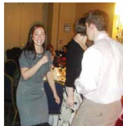
On the dance floor