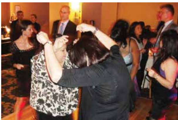
On the dance floor