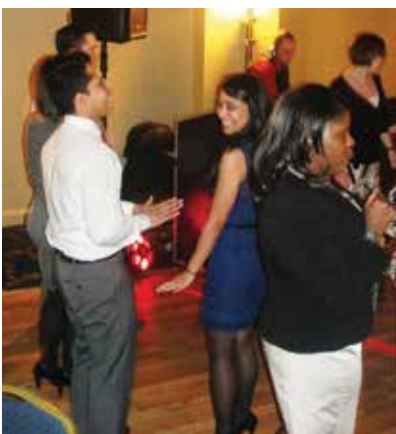
On the dance floor