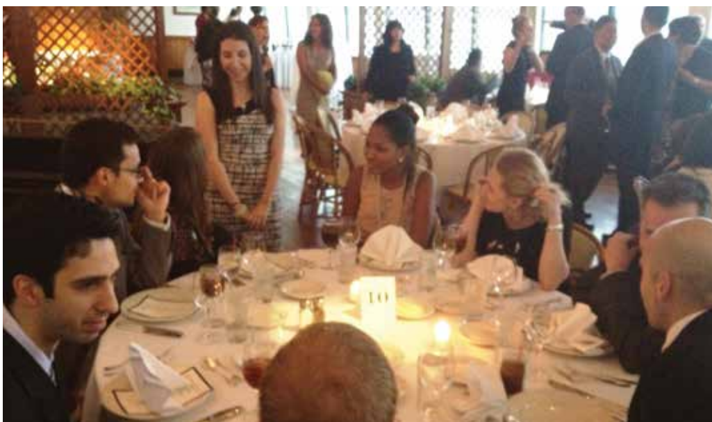
A glance at the graduation dinner which was held at the Water Club