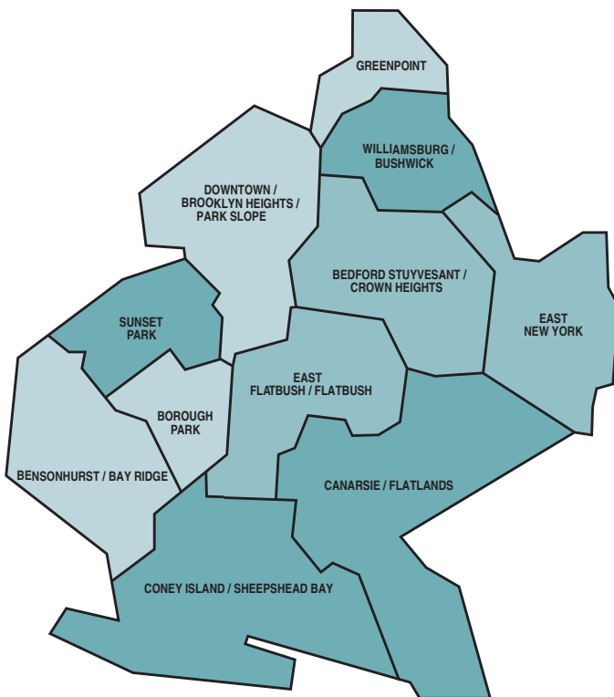
Obesity in Brooklyn Neighborhoods, 2009

Percent of Adults Who Are Obese Under 20% 20 to 30% Over 30%