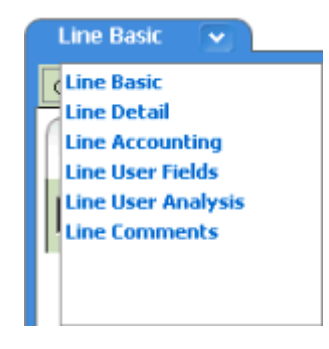
Figure 5. Line Item tabs

NOTE Clicking the Change button on any tab affects all the tabs and returns you to the Line Basic tab.