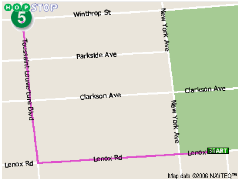
From subway station to 813 55TH ST (Total Walking: 0.37 miles/6 mins)