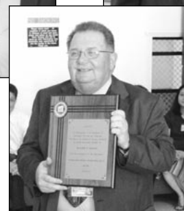
With Fred Hammond