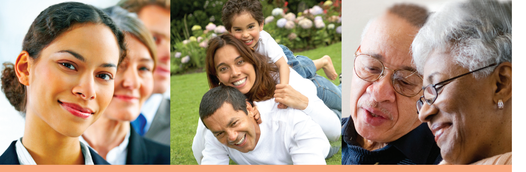
SUNY DOWNSTATE MEDICAL CENTER