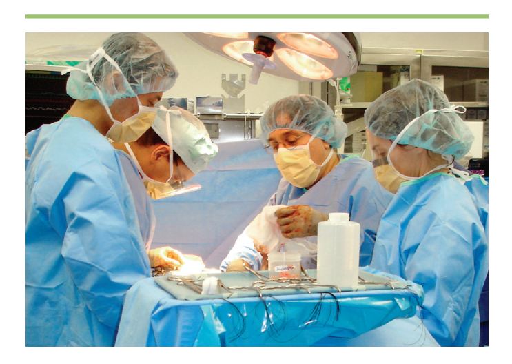
Our skilled surgeons perform surgery on a patient with pancreatic disease

No matter what the patient's needs are, coordinated care is delivered with compassion.