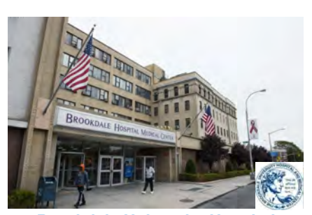
Brookdale University Hospital