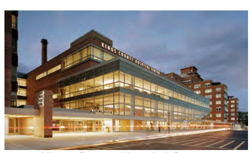
Kings County Hospital Center